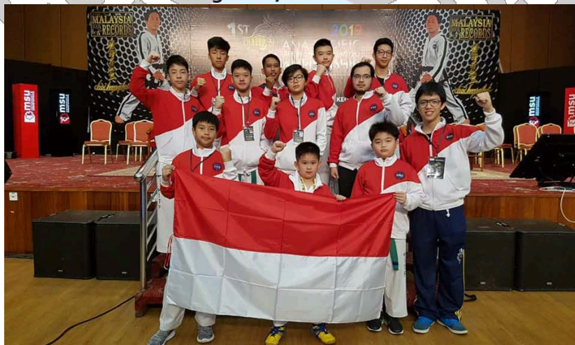
Indonesia ITF participating in Malaysia 1st Asia Pacific ITF Taekwon-Do (School) Championship 2019