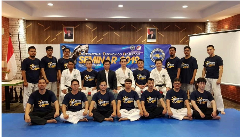
Indonesia ITF presents ITF Taekwon-Do Seminar in Yogyakarta 2019