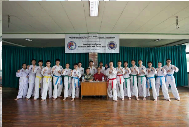
Grading Test , Indonesia ITF